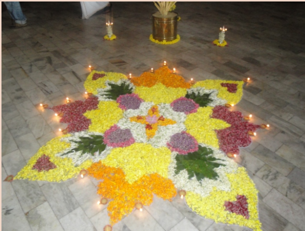
Colourful welcome extended by Merit students for the Onam Sadhya on 27th August 2010.