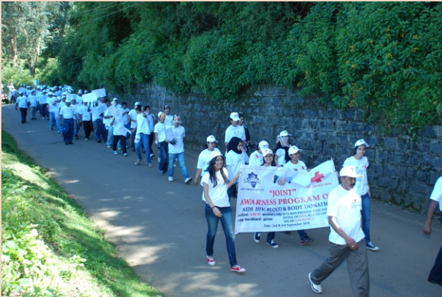
Merit students participating in a Rally across Ooty town, to create awareness on the dangerous consequences of AIDS. The Rally was organised in association with Red Cross , Ooty.