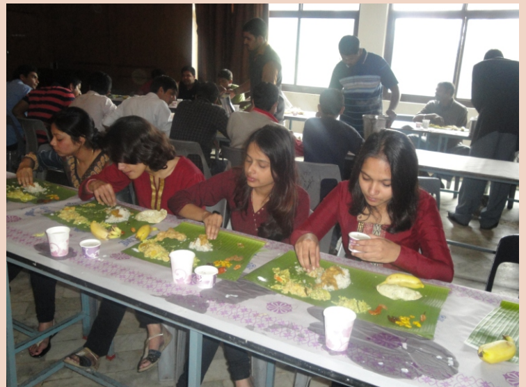
Students enjoying the Onam Sadhya(feast) consisting of many mouth-watering dishes from Gods Own Country-Kerala!