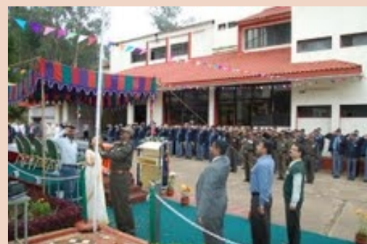
Faculty and students salute the Indian Flag on Independence Day.