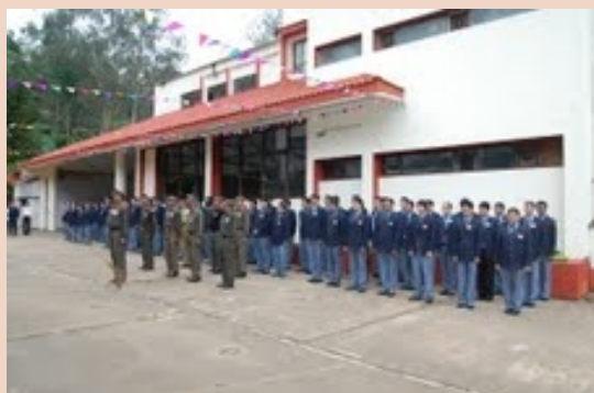
Merit students in perfect formation for the Flag hoisting on 15th August 2010.