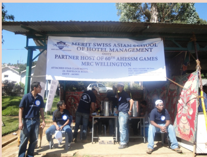
Merit co-sponsored the 60th AHESN Games held at MRC, Wellington from 1st to 4th September 2010. The student volunteers are seen manning a Refreshment Booth for the contestants of the Games.